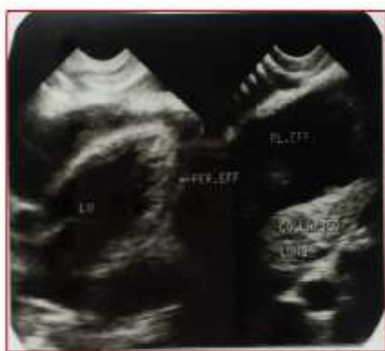
Ascites In Cardiac Disease