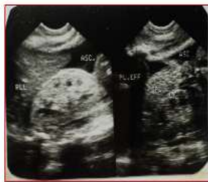
Ascites In Renal Disease