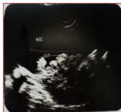
Ascites in a case of cardiac failure. There is presence of pleural effusion pericardial also. Matted gut in ascites